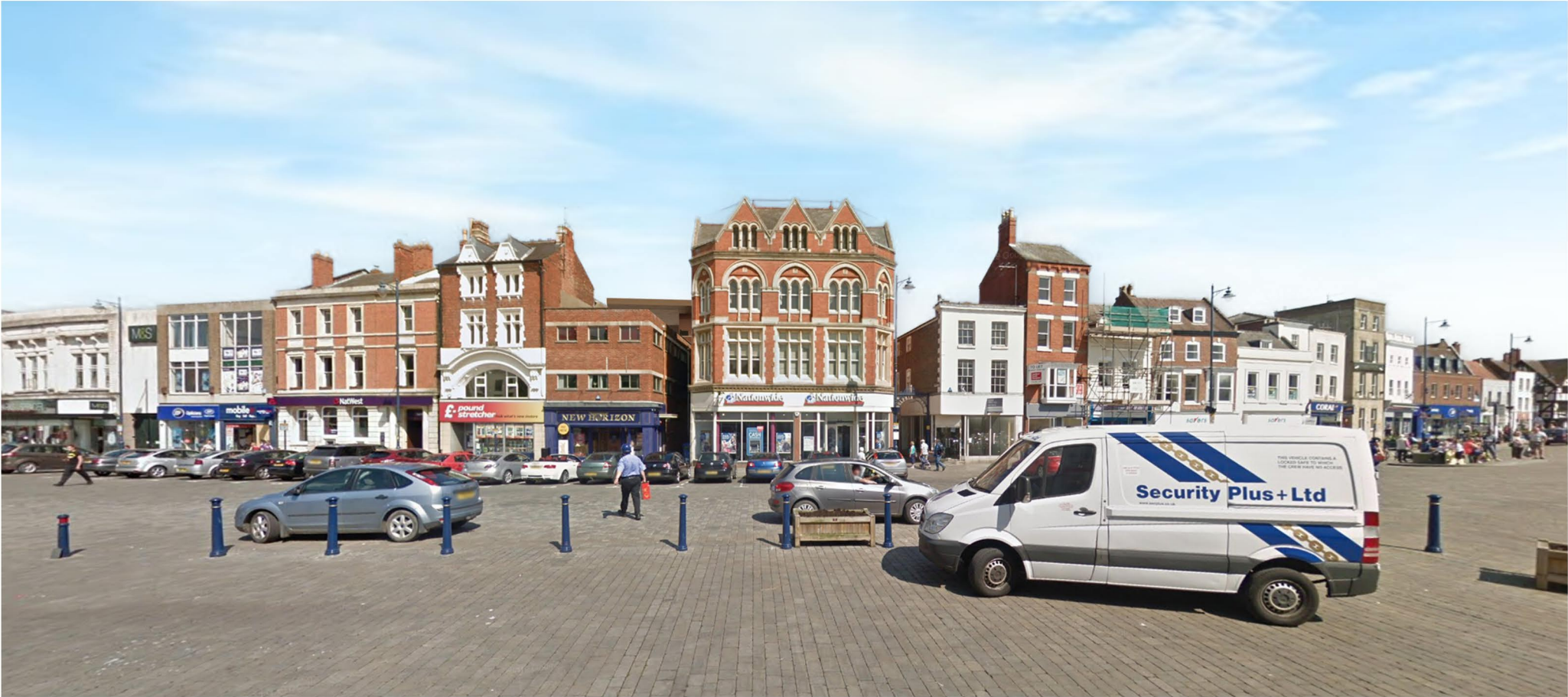
View From Eye